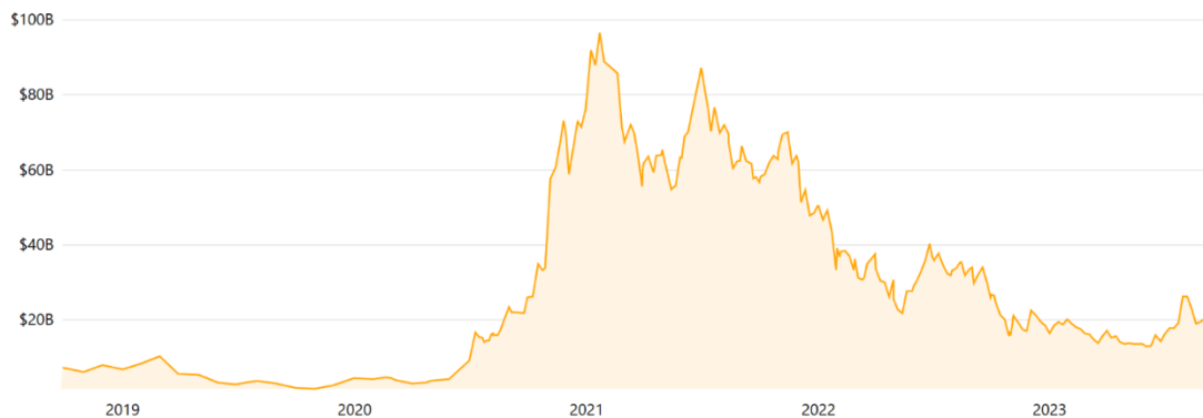
Figure 2: The changes on Market Cap. in NIO from 2018 to 2023.