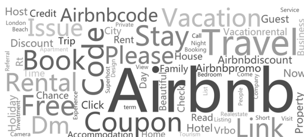
Figure 4: Negative Comments Wordcloud

Therefore, to increase consumer satisfaction and optimise its market performance, Airbnb needs to focus on improving its social media marketing strategy to reduce consumer dissatisfaction and improve its brand image and customer loyalty to consolidate its leading position in the market further. This continuous improvement and refined management of its social media strategy will be the key for Airbnb to maintain its edge in the highly competitive market.