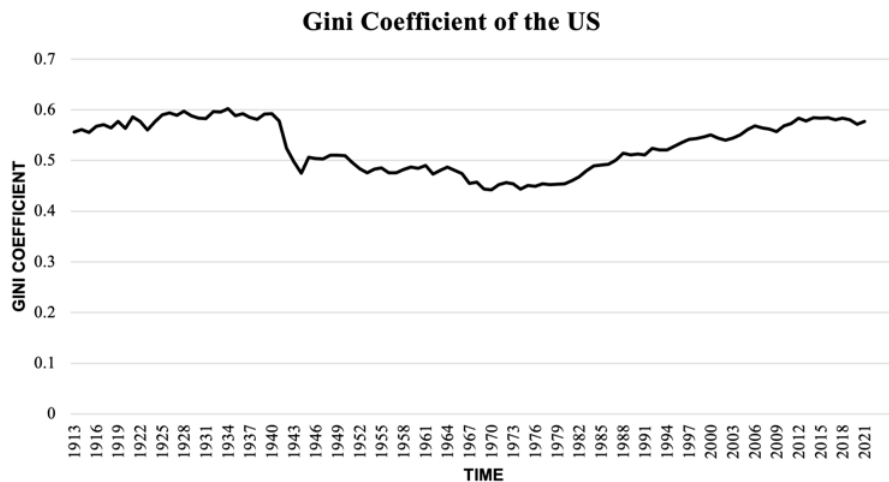
Figure 3. Gini Coefficient of the US. Data from World Inequality Database [14].

Furthermore, AI is likely to exacerbate income inequality to some extent. According to studies by Arntz, Gregory, and Zierahn, individuals earning lower incomes are more susceptible to AI-driven job displacement, and similarly, those with limited educational attainment are also more vulnerable to being replaced by AI. [13]. This suggests a correlation between education levels and income, with lower educational attainment associated with lower income. In today's society, companies increasingly demand workers skilled in AI-related technologies. However, individuals with lower levels of education are less likely to possess such skills, which may increase their difficulty in finding employment, further worsening income inequality. As depicted in Figure 3, from 1970 to 2021, the Gini index in the United States has consistently increased, partially explaining the negative impact of AI on income inequality.